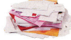
Mixed Paper Papel Mixto