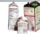
Wax-Coated Paper Drink Containers Recipientes de Papel Encerado para Bebidas