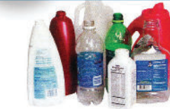
Plastic Containers #1 - 5 & #7 (No Styrofoam) Recipientes de Plástico Número Uno hasta Siete (No Poliestireno)