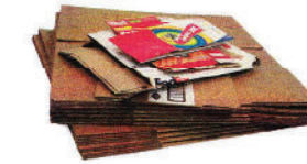
Corrugated Cardboard & Boxboard Cajas de Cartón & Cartulina Gris