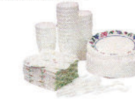
Paper, Plastic & Styrofoam Serving Items Platos, Tazas Y Utensilios De Servir de Papel, Poliestireno y Plástico