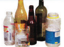
Glass Bottles & Containers Botellas y Envases de Vidrio