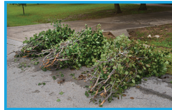
Proper placement of brush