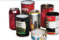
Aluminum, Steel & Tin Containers Latas de Aluminio, Acero y Estaño