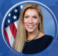
Beth Van Duynes U.S. CONGRESSWOMAN