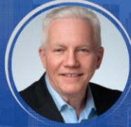
Bruce Arfsten TOWN OF ADDISON MAYOR