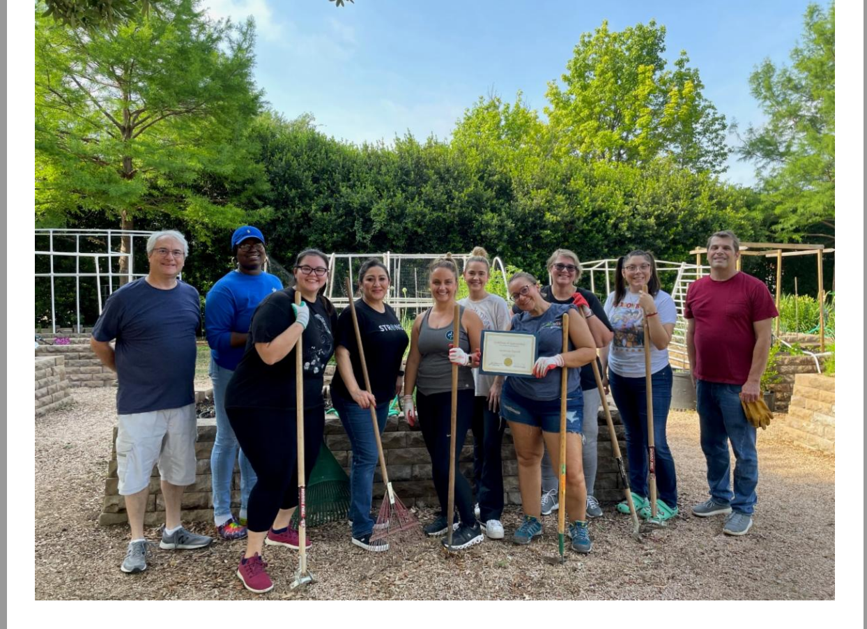
On May 9, Dominion Payroll employees volunteered to clean the Addison Community Garden as part of the corporate cleanup volunteer program. Many thanks to the team who dedicated three hours to beautifying this garden.

If you have a group who is interested in volunteering around town or at special events, please contact Addison's volunteer coordinator at <a href="mailto:volunteers@addisontx.gov">volunteers@addisontx.gov</a>.