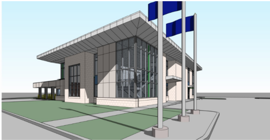
3 NE CORNER PERSPECTIVE