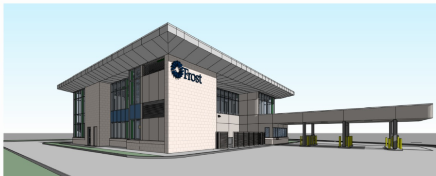
3 SW CORNER PERSPECTIVE

At its March 14 meeting, the City Council approved a zoning amendment for the 1.470 acre property at 3843 Belt Line Road that was formerly Humberdink's Restaurant and Brewpub to make way for a two-story Frost Bank building. The first floor of the building will be comprised primarily of the bank lobby, offices, and motor bank facilities. The second